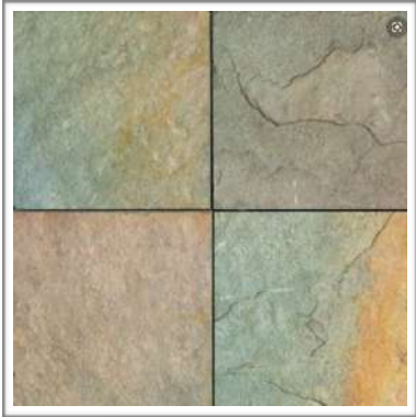
Ramp Tiles 10"x10"